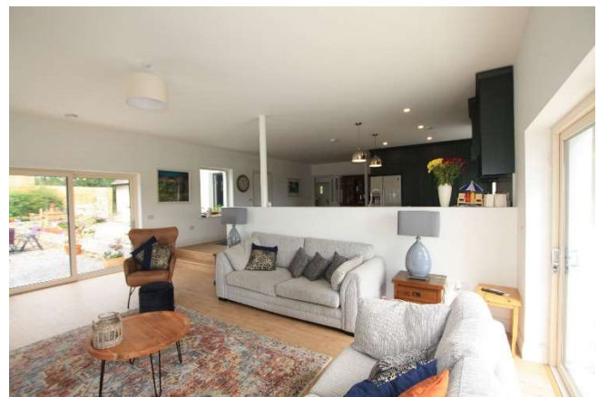
Split level – kitchen dining living